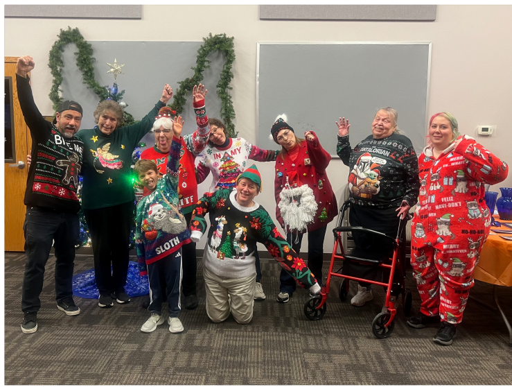
Ugly Sweater Contest